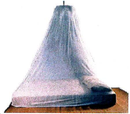
Once the bed frame has been inspected, and the mattress cleaned and sealed with a cover; a bed net can be used to keep additional bugs away while treatment commences.

Note: Chemical treatment may be part of an IPM plan. If you choose to treat the infestation with an insecticide, call a licensed, Professional Pest Control Operator for more information. Use the least toxic product available and follow all manufacturers' instructions.