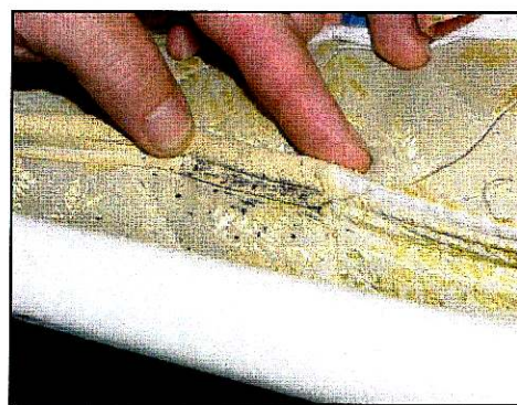
Blood spots on a mattress seam are often grouped. This is an indication of a current or past infestation of bed bugs.