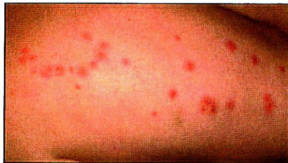
Reaction to bed bug bites. Bites are usually clustered on areas of the body not covered by night clothing.